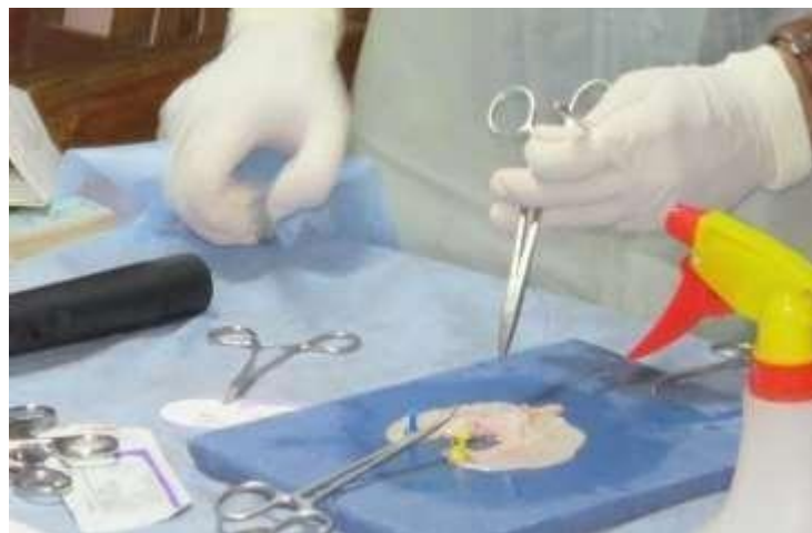
Suturing & Knotting model