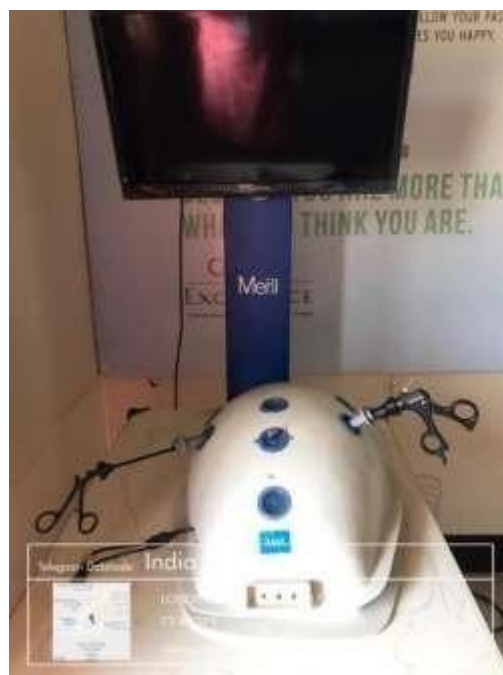
Endo-trainer Surgery Department for Laparoscopic Surgery