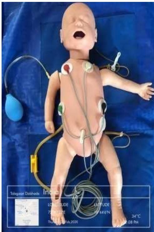
New born manikin for Neonatal resuscitation