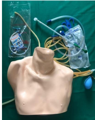
Manikin for Central line Cannulation