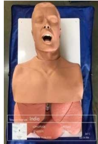
Airway and Intubation manikin