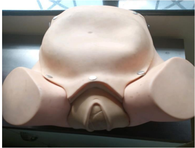
Pelvic floor and delivering parturiant model