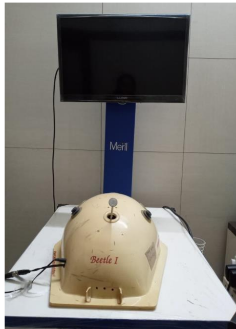
Endo Pelvis Trainer