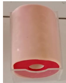
Multi-functional injection pad