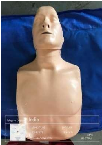
Manikin for Basic Life Support