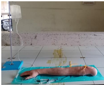
. I.V. Training Arm