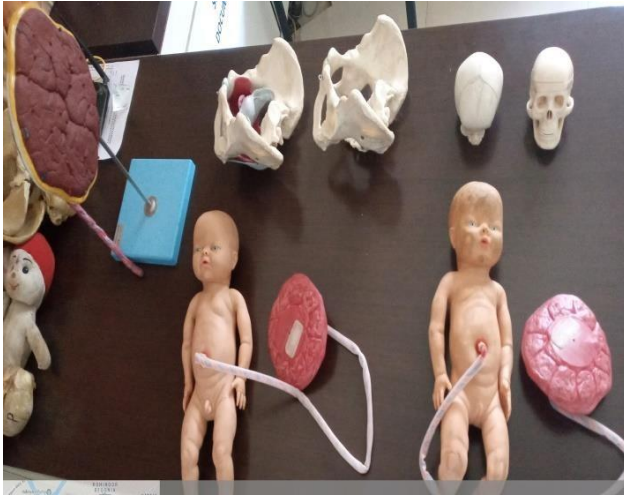
Placenta model and Placenta and newborn model