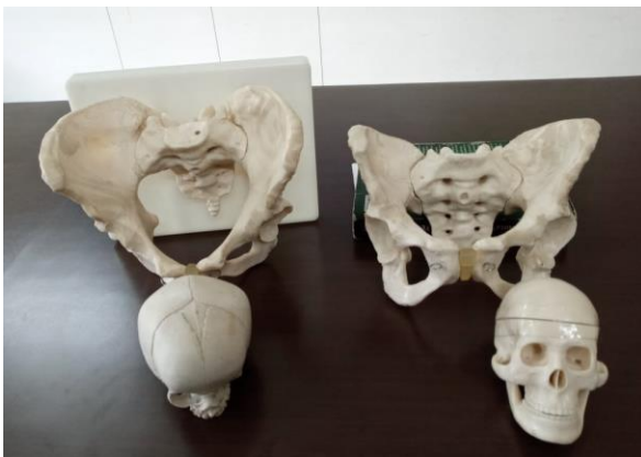
Fetal Skull & Maternal Pelvis