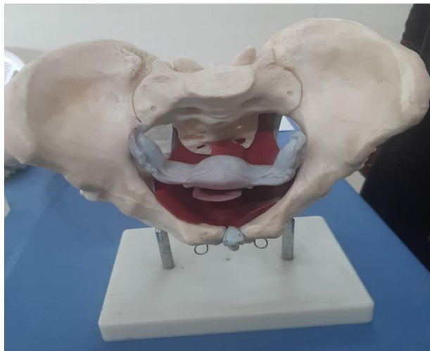
Pelvis with uterus ovaries and Fallopian tube