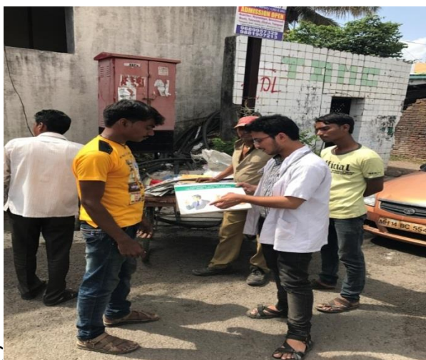
World TB Day UHTC