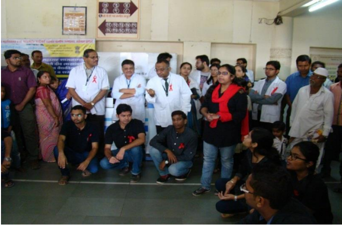
World AIDS Day, RHTC