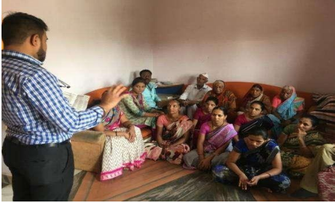
World Malaria Day RHTC