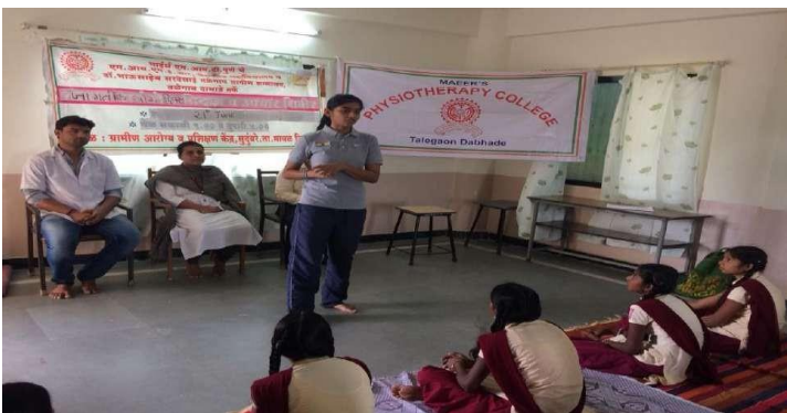
Elder Day , UHTC