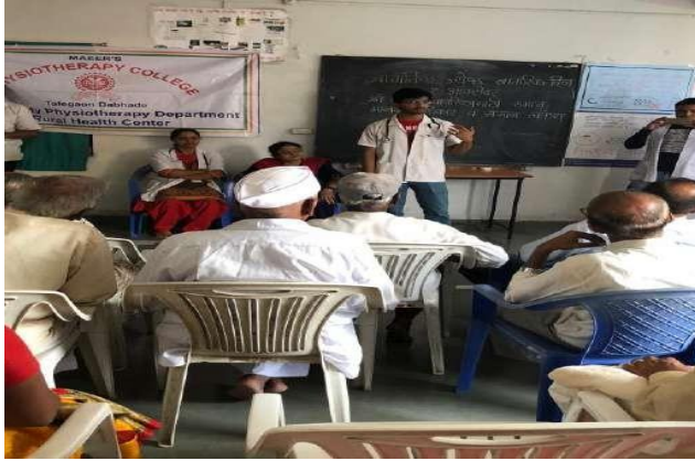
Mental Health day, UHTC