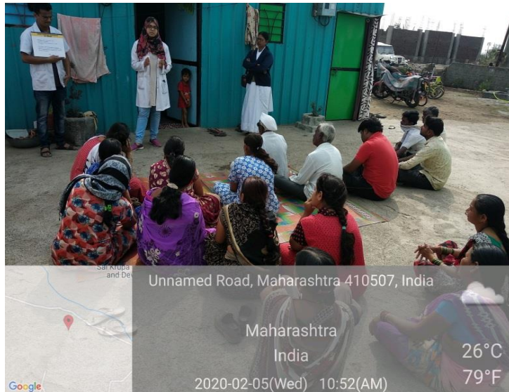
Cancer Day RHTC