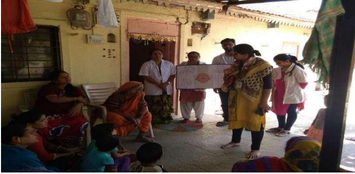
YOGA DAY RHTC