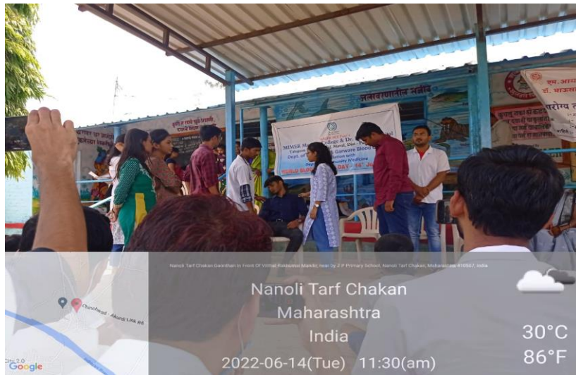
Skit by IInd MBBS Students