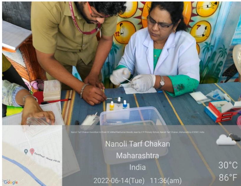
Blood Grouping Camp