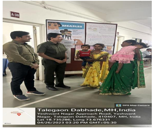
Talegaon Dabhade, MH, India Yeshwant Nagar Approach Road, Yashwant Nagar, Talegaon Dabhade, 410407, MH, India Lat 18.735286, Long 73.676331 04/26/2023 03:20 PM GMT +05:30