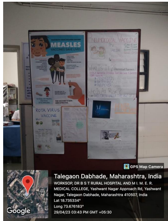
Talegaon Dabhade, Maharashtra, India WORKSOP, DR B S T RURAL HOSPITAL AND M I. M. E. R. MEDICAL COLLEGE, Yashwant Nagar Approach Rd, Yashwant Nagar, Talegaon Dabhade, Maharashtra 410507, India Lat 18.735334° Long 73.676183° 29/04/23 03:43 PM GMT +05:30