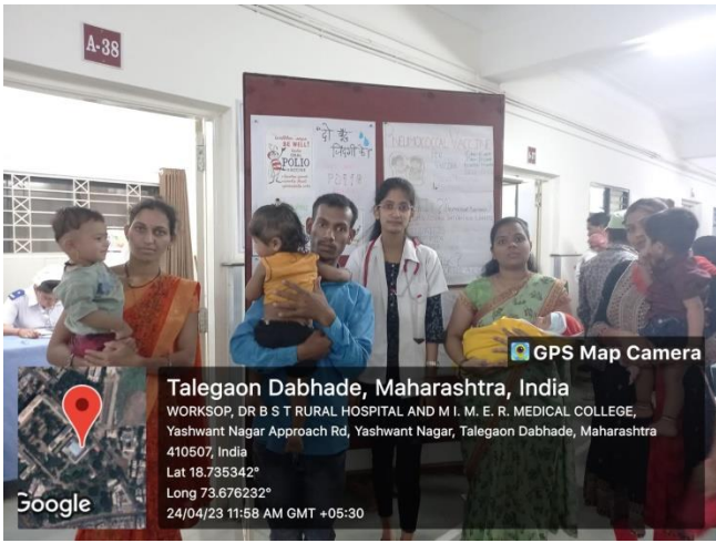
Talegaon Dabhade, Maharashtra, India WORKSOP, DR B S T RURAL HOSPITAL AND M I. M. E. R. MEDICAL COLLEGE, Yashwant Nagar Approach Rd, Yashwant Nagar, Talegaon Dabhade, Maharashtra 410507, India Lat 18.735342° Long 73.676232° 24/04/23 11:58 AM GMT +05:30