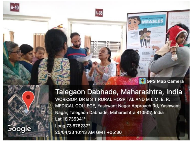
Talegaon Dabhade, Maharashtra, India WORKSOP, DR B S T RURAL HOSPITAL AND M I. M. E. R. MEDICAL COLLEGE, Yashwant Nagar Approach Rd, Yashwant Nagar, Talegaon Dabhade, Maharashtra 410507, India Lat 18.735341° Long 73.676237° 25/04/23 10:43 AM GMT +05:30