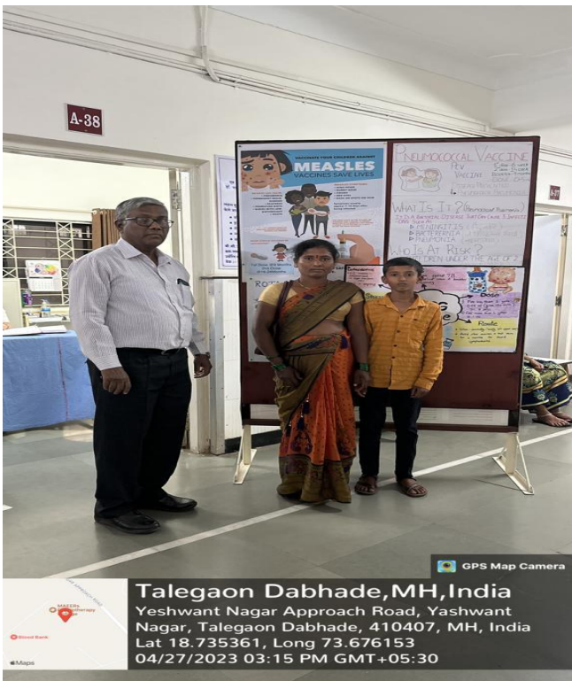
Talegaon Dabhade, MH, India Yeshwant Nagar Approach Road, Yashwant Nagar, Talegaon Dabhade, 410407, MH, India Lat 18.735361, Long 73.676153 04/27/2023 03:15 PM GMT +05:30