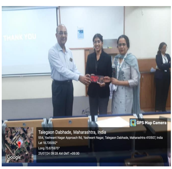
Symposium on Lens on 25/07/2024 (Thursday) at Sushrut Hall