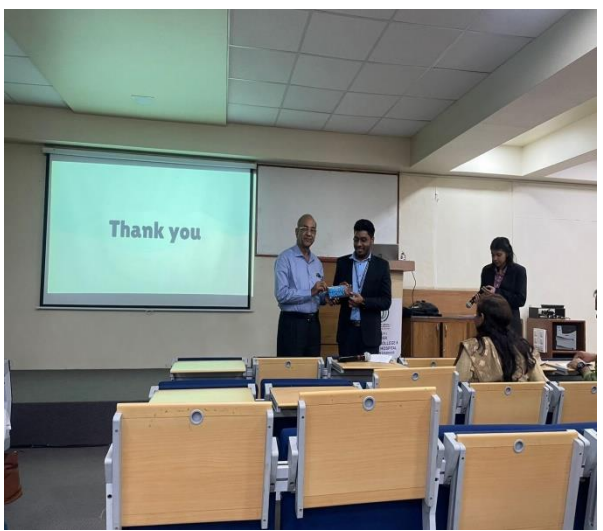
Symposium on Eye Lids on 18/07/2024 (Thursday) at Sushrut Hall