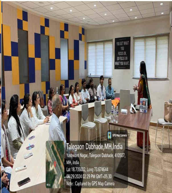
Contact Lens Workshop on 29.08.2024 (Thursday) at Skill Lab