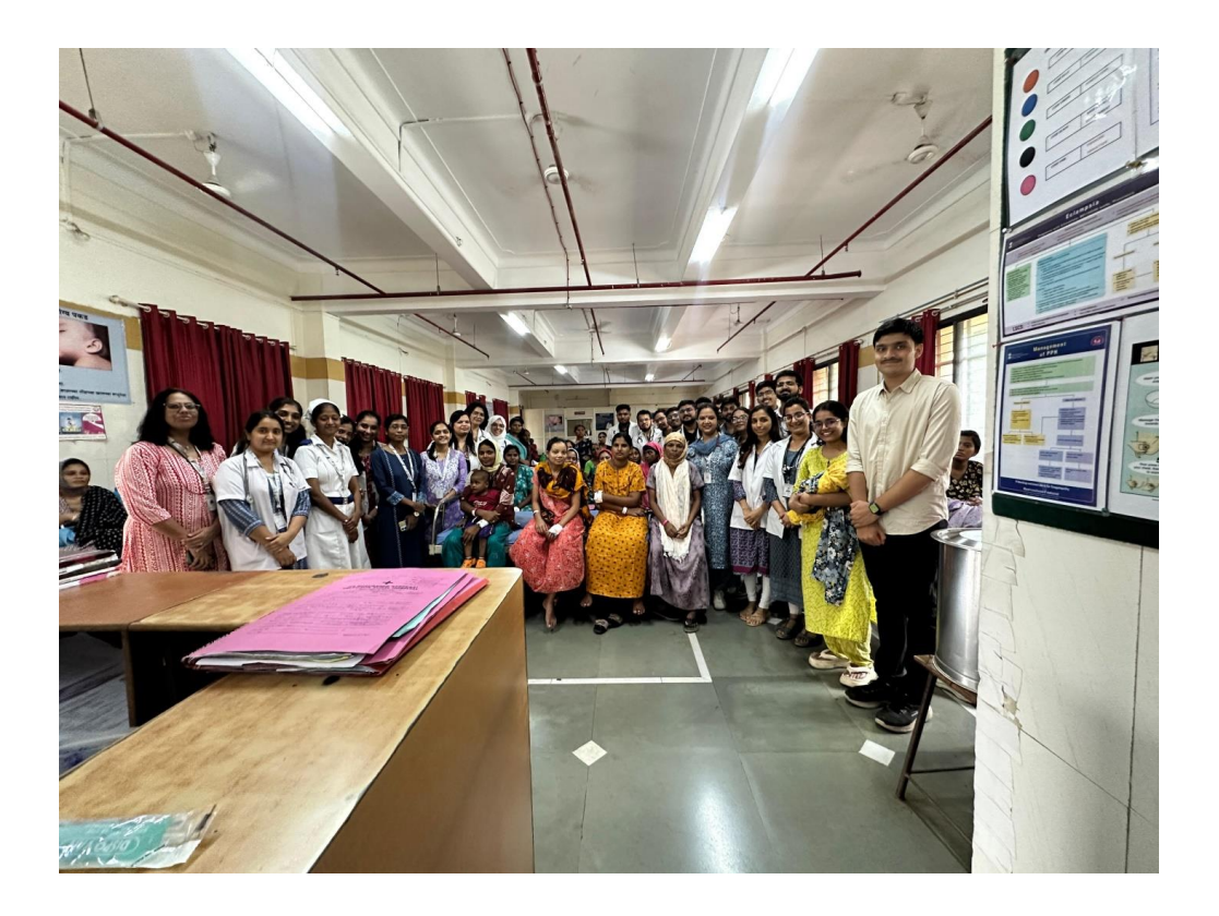
Protessor & HOD Dept. of Obel & Gyn. MIMER MEDICAL COLLEGE TALEGAON (D), PUNE