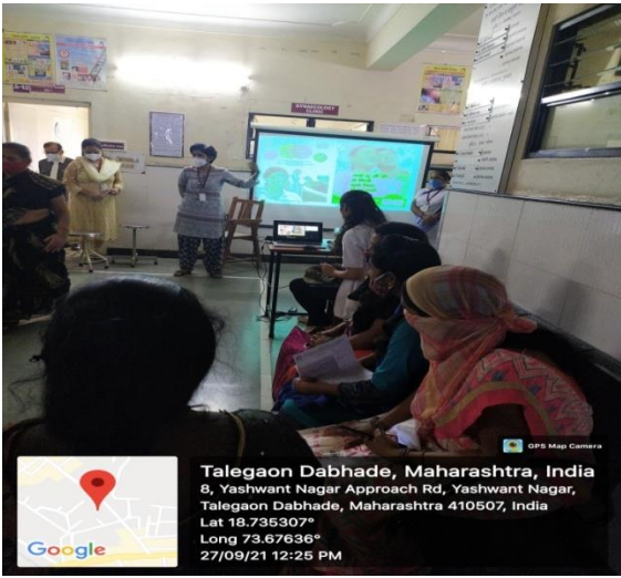
Continuous running PPT at OPD