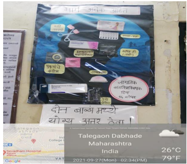
Poster displayed in OPD