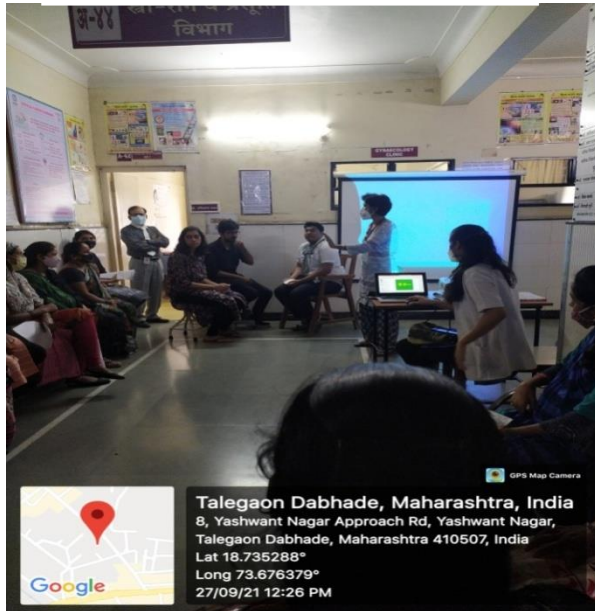
Skit played by Residents and Interns at OPD