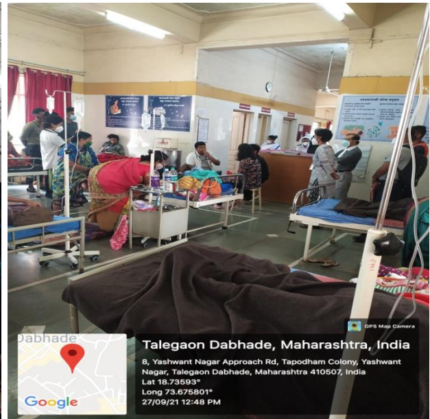
Skit played by Residents and Interns in PNC ward