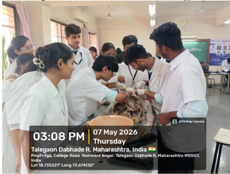
Photo Dissection Competition - 'Submandibular Region'