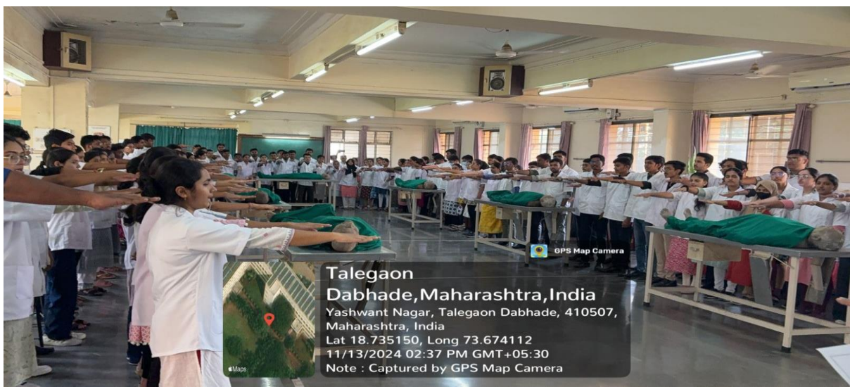
Talegaon Dabhade, Maharashtra, India Yashwant Nagar, Talegaon Dabhade, 410507, Maharashtra, India Lat 18.735150, Long 73.674112 11/13/2024 02:37 PM GMT+05:30 Note : Captured by GPS Map Camera