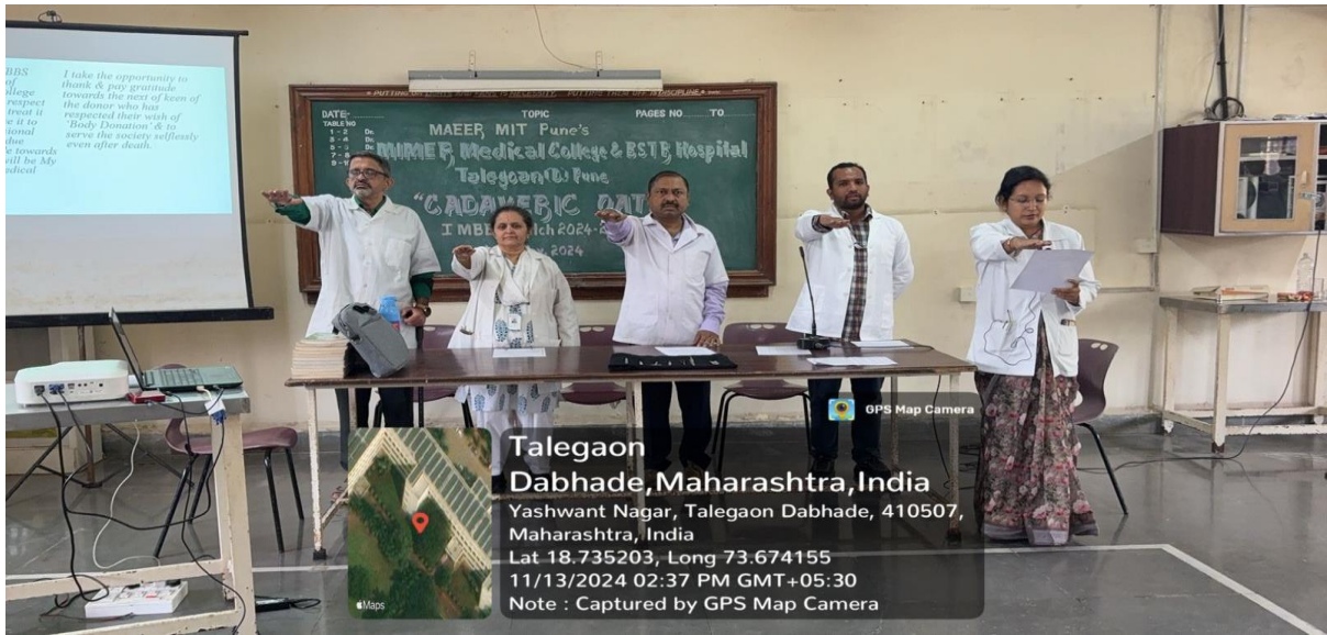
Talegaon Dabhade, Maharashtra, India Yashwant Nagar, Talegaon Dabhade, 410507, Maharashtra, India Lat 18.735203, Long 73.674155 11/13/2024 02:37 PM GMT+05:30