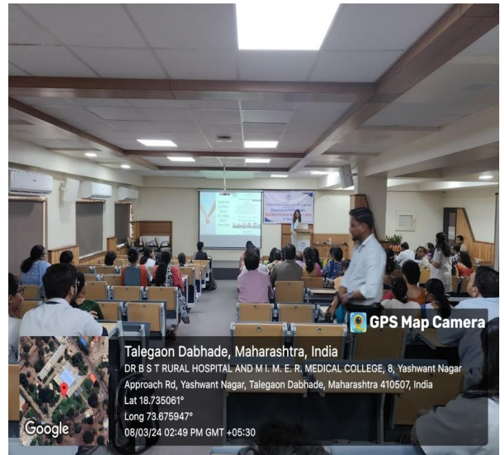
GPS Map Camera Talegaon Dabhade, Maharashtra, India DR B S T RURAL HOSPITAL AND M I. M. E. R. MEDICAL COLLEGE, 8, Yashwant Nagar Approach Rd, Yashwant Nagar, Talegaon Dabhade, Maharashtra 410507, India Lat 18.735061° Long 73.675947° 08/03/24 02:49 PM GMT +05:30