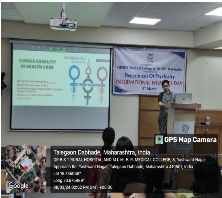
GPS Map Camera Talegaon Dabhade, Maharashtra, India DR B S T RURAL HOSPITAL AND M I. M. E. R. MEDICAL COLLEGE, 8, Yashwant Nagar Approach Rd, Yashwant Nagar, Talegaon Dabhade, Maharashtra 410507, India Lat 18.735056° Long 73.675989° 08/03/24 02:52 PM GMT +05:30