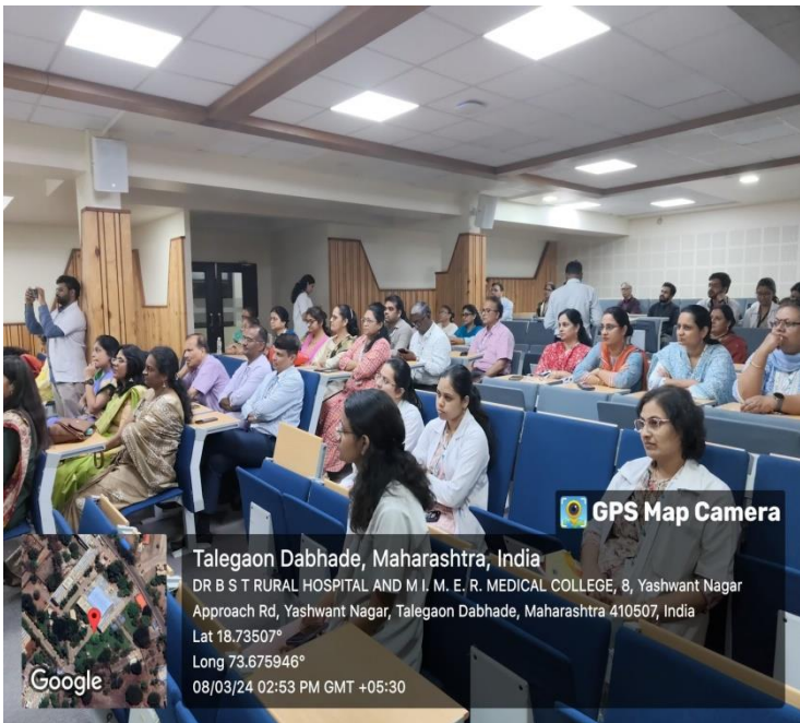
GPS Map Camera Talegaon Dabhade, Maharashtra, India DR B S T RURAL HOSPITAL AND M I. M. E. R. MEDICAL COLLEGE, 8, Yashwant Nagar Approach Rd, Yashwant Nagar, Talegaon Dabhade, Maharashtra 410507, India Lat 18.73507° Long 73.675946° 08/03/24 02:53 PM GMT +05:30