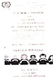
womens day.png 465K

PSYCHIATRY DEPARTMENT <psychiatry@mitmimer.com>