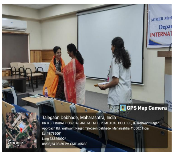
GPS Map Camera Talegaon Dabhade, Maharashtra, India DR B S T RURAL HOSPITAL AND M I. M. E. R. MEDICAL COLLEGE, 8, Yashwant Nagar Approach Rd, Yashwant Nagar, Talegaon Dabhade, Maharashtra 410507, India Lat 18.73506° Long 73.675992° 08/03/24 03:39 PM GMT +05:30