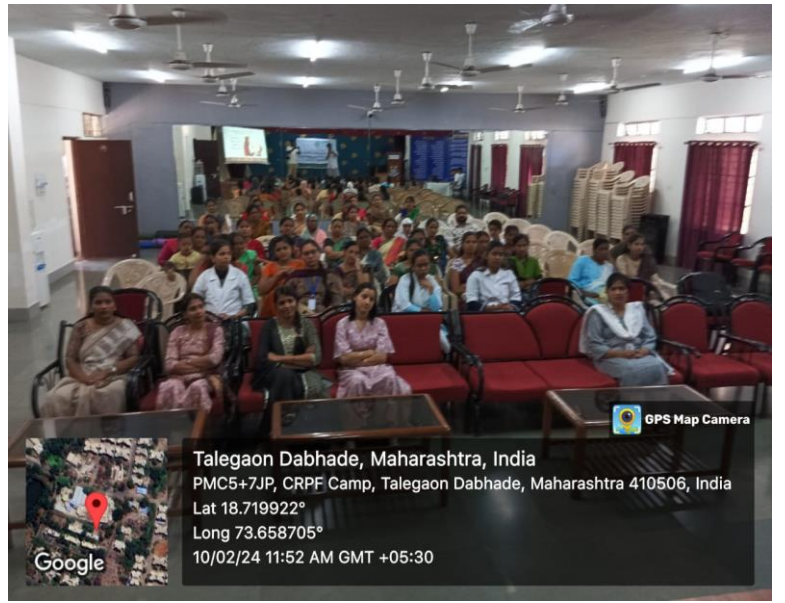
Talegaon Dabhade, Maharashtra, India PMC5+7JP, CRPF Camp, Talegaon Dabhade, Maharashtra 410506, India Lat 18.719922° Long 73.658705° 10/02/24 11:52 AM GMT +05:30