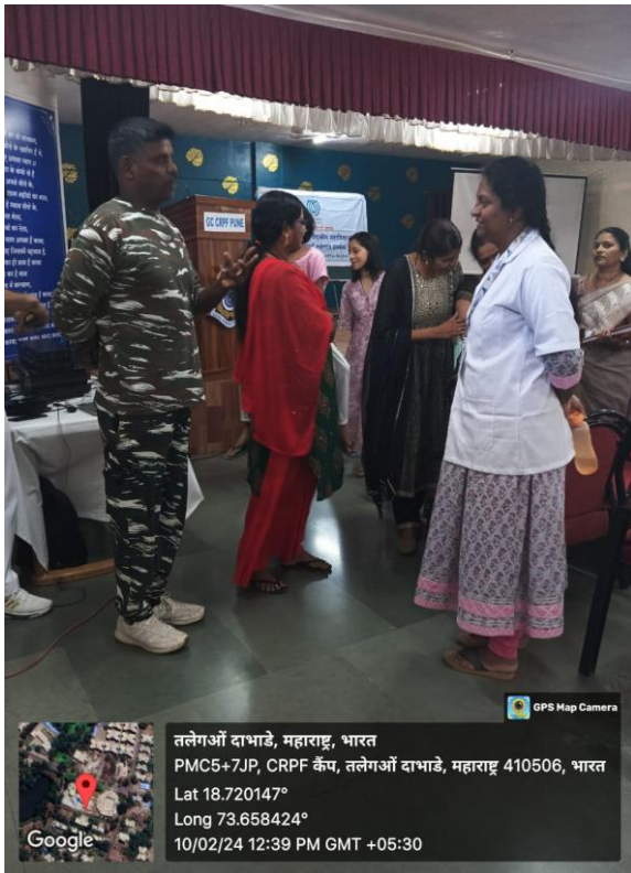
तलेगऑं दाभाडे, महाराष्ट्र, भारत PMC5+7JP, CRPF कैंप, तलेगऑं दाभाडे, महाराष्ट्र 410506, भारत Lat 18.720147° Long 73.658424° 10/02/24 12:39 PM GMT +05:30