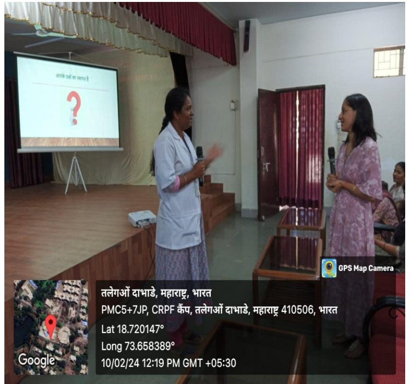
तलेगऑं दाभाडे, महाराष्ट्र, भारत PMC5+7JP, CRPF कैंप, तलेगऑं दाभाडे, महाराष्ट्र 410506, भारत Lat 18.720147° Long 73.658389° 10/02/24 12:19 PM GMT +05:30