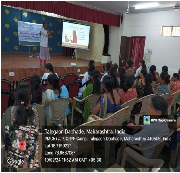
Talegaon Dabhade, Maharashtra, India PMC5+7JP, CRPF Camp, Talegaon Dabhade, Maharashtra 410506, India Lat 18.719922° Long 73.658705° 10/02/24 11:52 AM GMT +05:30