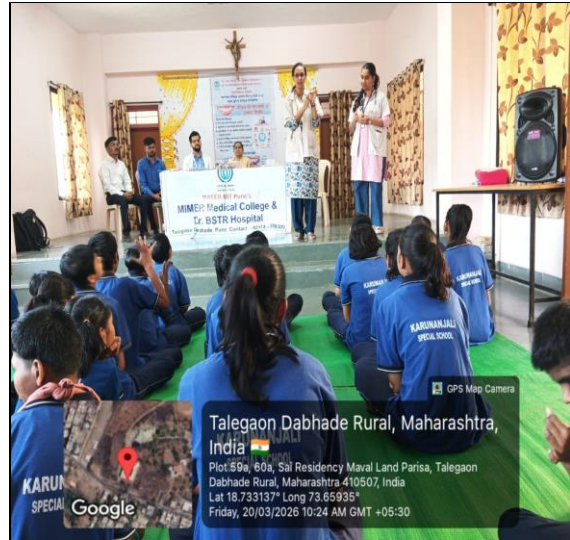
Health talk & brushing technique demo