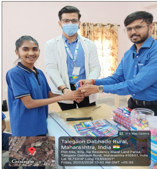
Oral hygiene kits & stationary kit distribution