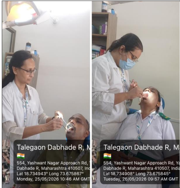
Oral screening for the Non-teaching staff