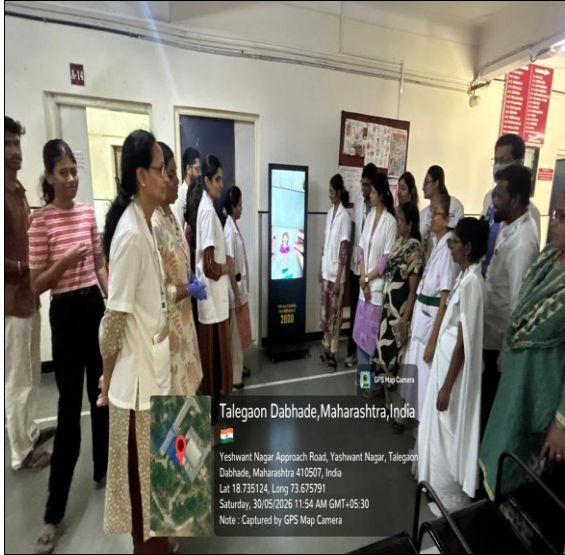
Digital standee screening documentary films