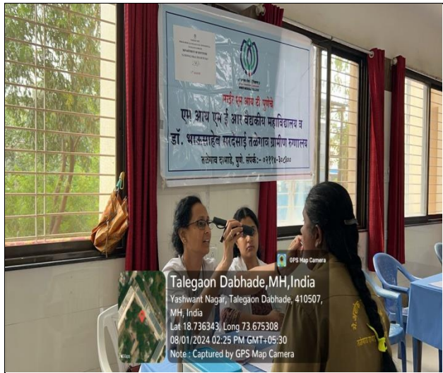
Dental check-up done for the employees