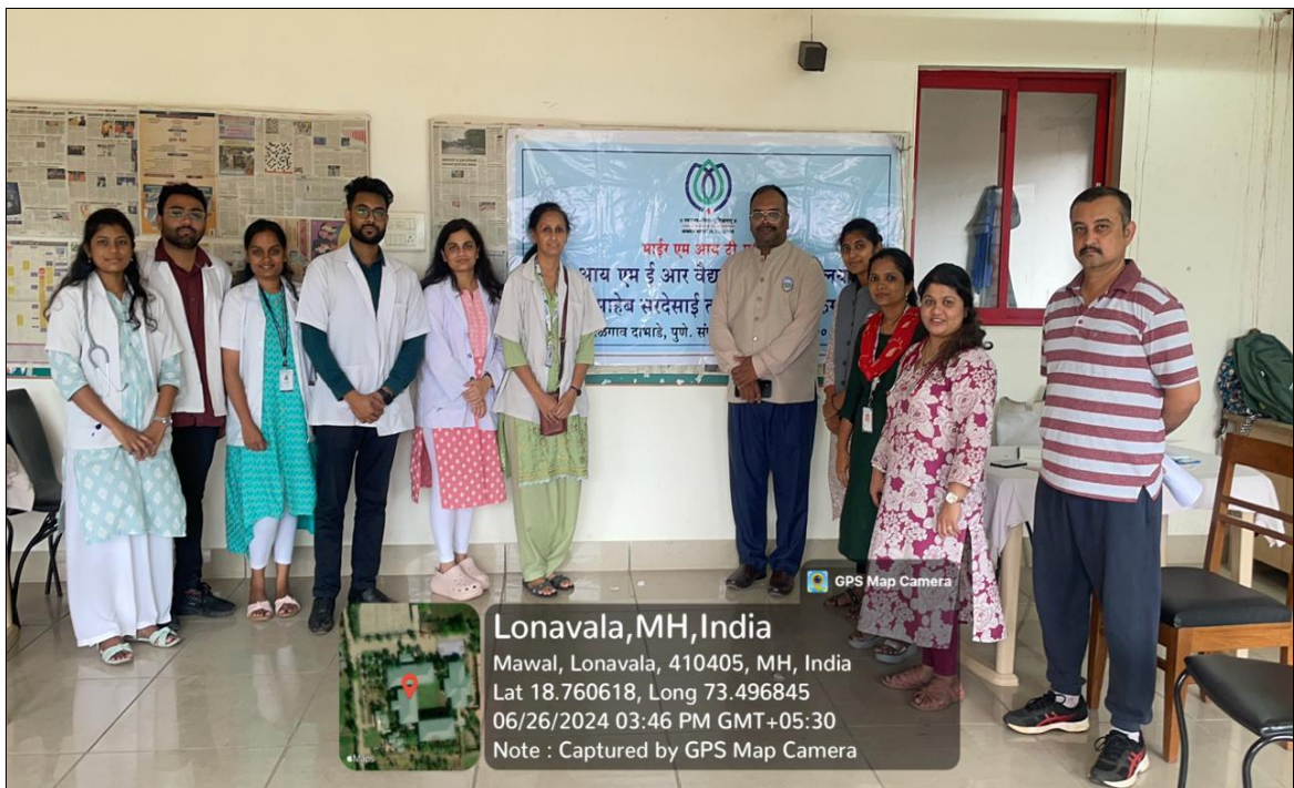
Medical Team of Doctors for the camp along with the school authority