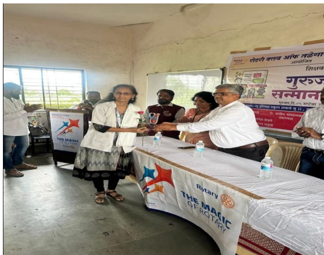
Felicitation done by the school Principal