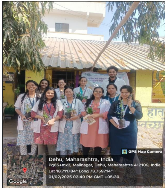
Group photo of the Medical team