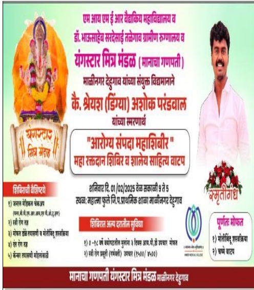
Flyer of the camp