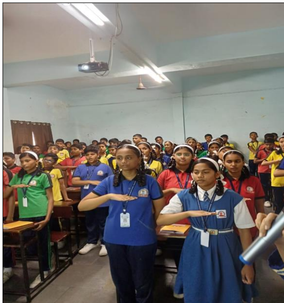
Anti-addiction oath taken from the students