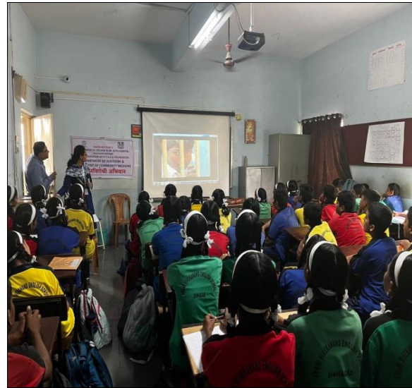
Documentary film "Pratidnya" shown