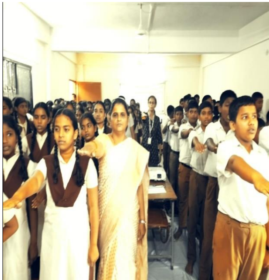
Anti addiction Oath taken from the students