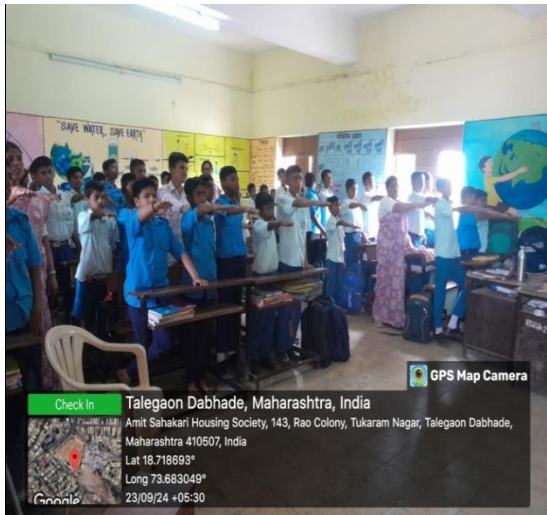
Antiaddiction Oath taken from the students