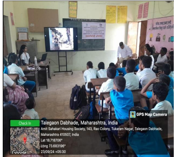
Documentary Pratidnya shown