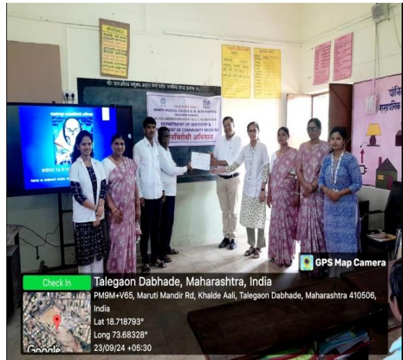
Certificate handed over to school authority