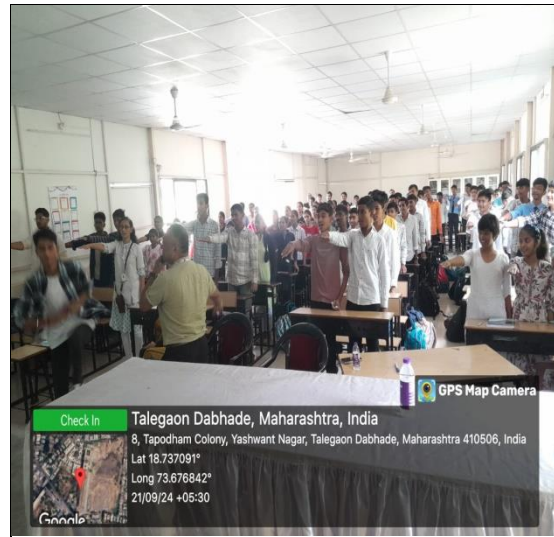
Anti-addiction oath taken from the students