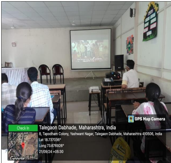
film "Valan" shown to the students