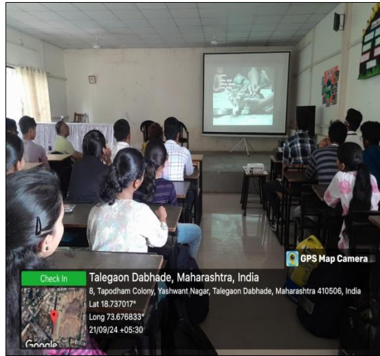
Documentary "Pratidnya" Shown