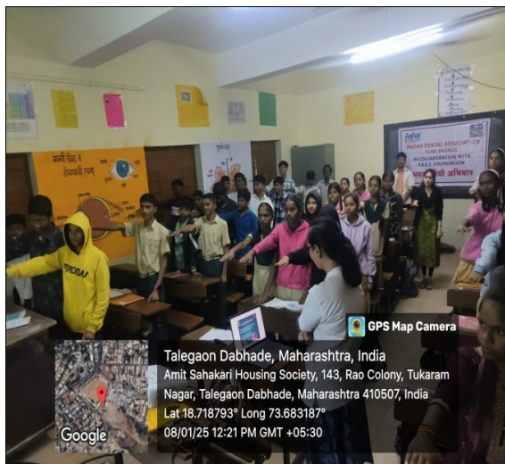
Oath taken from the students