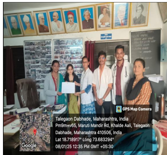
Certificate handed over