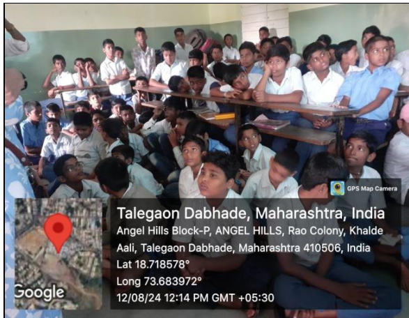
Students of std. 6 th – 8 th