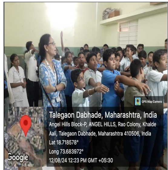
Anti-addiction oath taken by the students