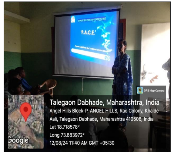
PPT shown to the students