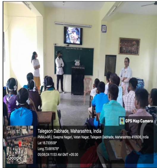
film 'Pratidnya' shown to the students