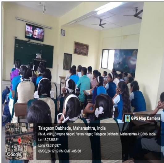
Documentary film 'VALAN' shown to the students