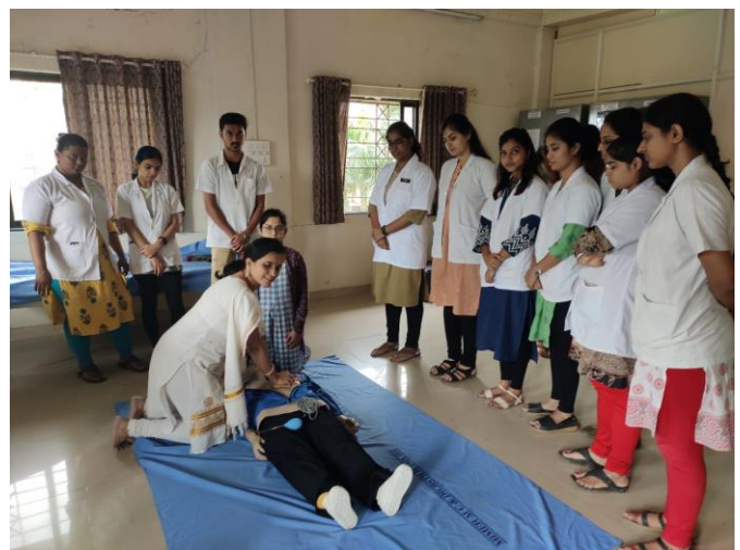
Training Of "Chest Compression"