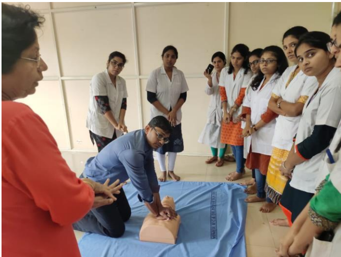
Training Of "Chest Compression"