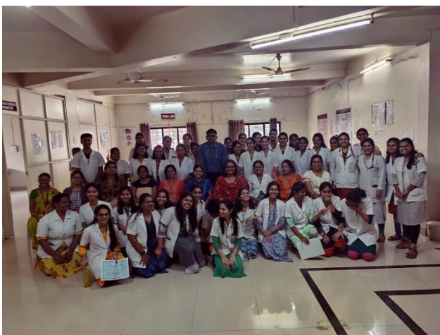
Post CPR workshop group photo with Physiotherapy Interns.