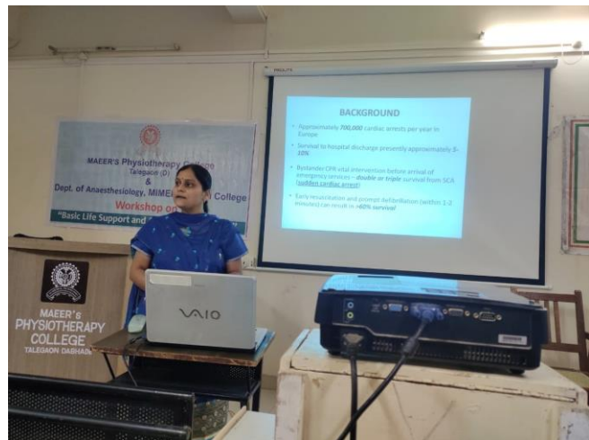
LECTURE ON "Basic Life Support & Airway Management"