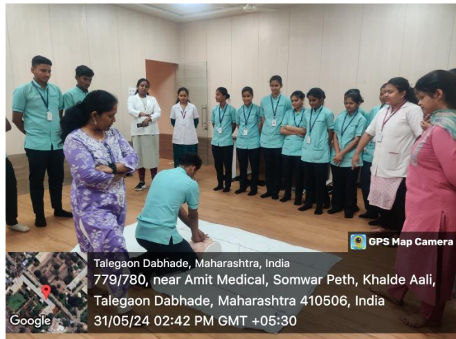
Hands On Training of BLS (Chest Compression)