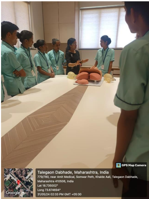
Hands On Training of BLS (Airway Management)