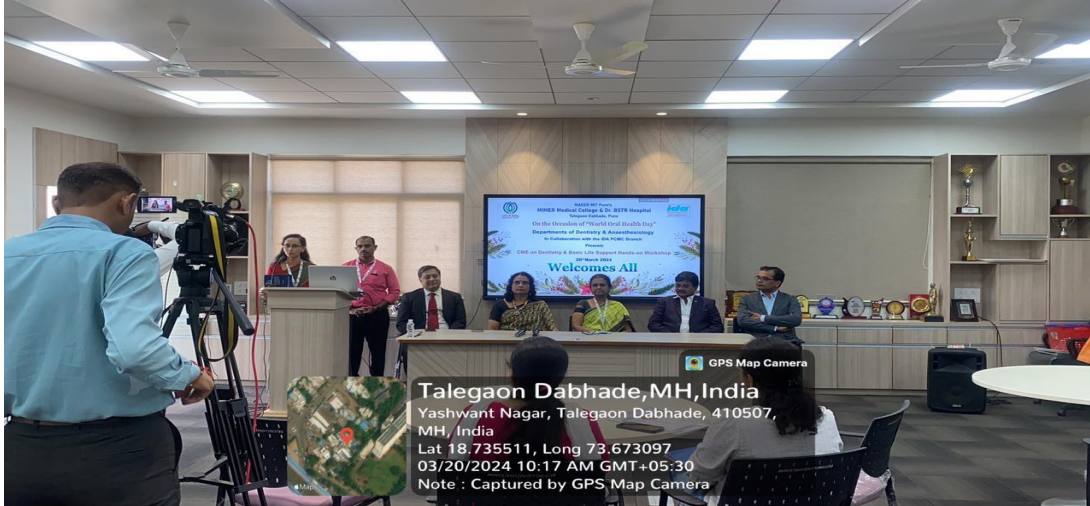
Inauguration function of the CME on Dentistry