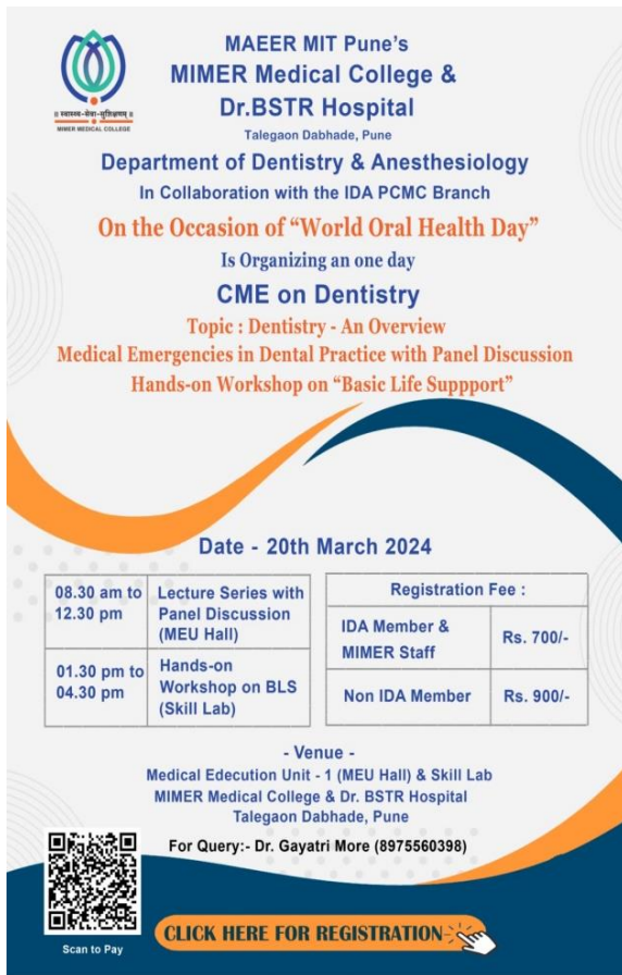
Flyer of the CME