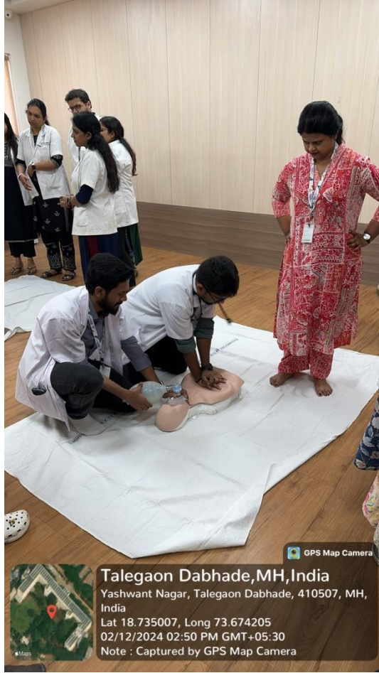
Talegaon Dabhade, MH, India Yashwant Nagar, Talegaon Dabhade, 410507, MH, India Lat 18.735007, Long 73.674205 02/12/2024 02:50 PM GMT+05:30 Note : Captured by GPS Map Camera