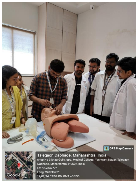
Talegaon Dabhade, Maharashtra, India shop No 3 khau Gully, opp. Medical Collage, Yashwant Nagar, Talegaon Dabhade, Maharashtra 410507, India Lat 18.734777° Long 73.674573° 12/02/24 03:04 PM GMT +05:30