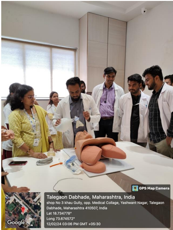
Talegaon Dabhade, Maharashtra, India shop No 3 khau Gully, opp. Medical Collage, Yashwant Nagar, Talegaon Dabhade, Maharashtra 410507, India Lat 18.734778° Long 73.674572° 12/02/24 03:06 PM GMT +05:30