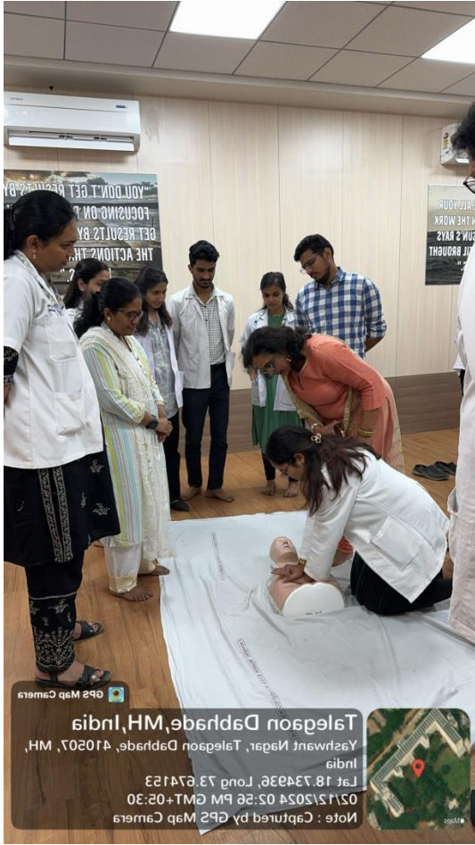
Talegaon Dabhade, MH, India Yashwant Nagar, Talegaon Dabhade, 410507, MH, India Lat 18.734936, Long 73.674123 02/12/2024 02:26 PM GMT+05:30