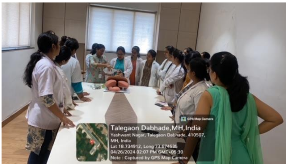
Hands On Training of BCLS (Airway Management)