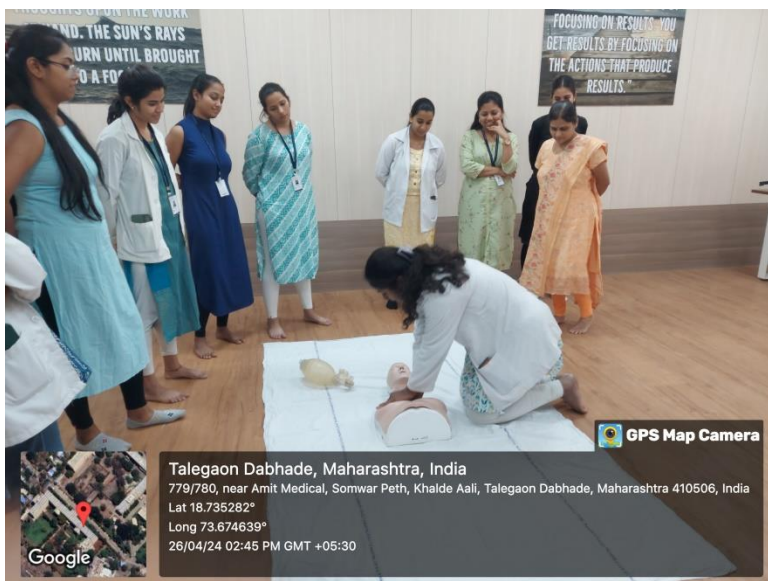
Hands On Training of BCLS