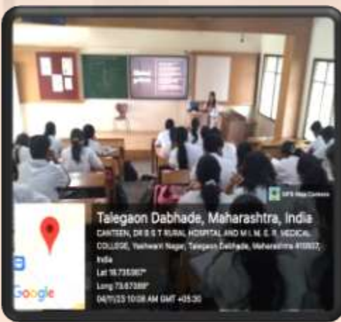
SDL - Quiz