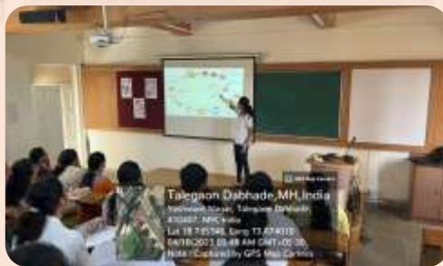
SDL- Student Seminar