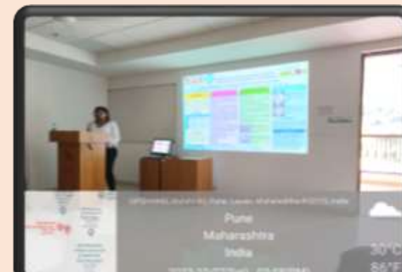
Poster presentations by Residents