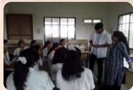
Case based Learning