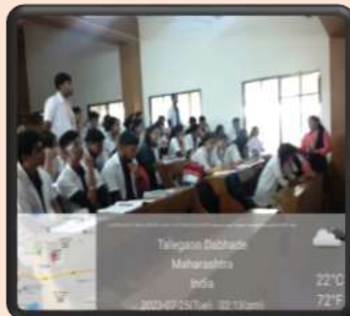
Case based Learning