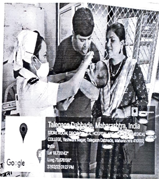
Talegaon Dabhade, Maharashtra, India STORE ROOM, DR B S T RURAL HOSPITAL AND M I M. E. R. MEDICAL COLLEGE, Yashwant Nagar, Talegaon Dabhade, Maharashtra 410507, India Lat 18.735142° Long 73.676198° 27/02/22 01:27 PM