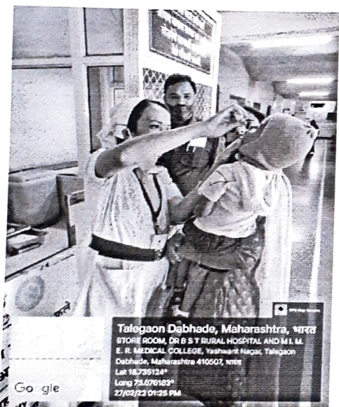
Talegaon Dabhade, Maharashtra, भारत STORE ROOM, DR B S T RURAL HOSPITAL AND M I M. E. R. MEDICAL COLLEGE, Yashwant Nagar, Talegaon Dabhade, Maharashtra 410507, भारत Lat 18.735124° Long 73.676183° 27/02/22 01:25 PM