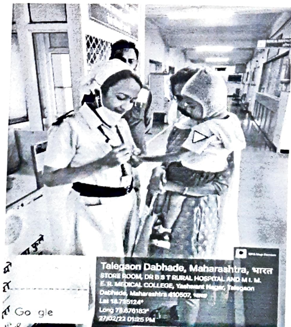
Talegaon Dabhade, Maharashtra, भारत STORE ROOM, DR B S T RURAL HOSPITAL AND M I M. E. R. MEDICAL COLLEGE, Yashwant Nagar, Talegaon Dabhade, Maharashtra 410507, भारत Lat 18.735124° Long 73.676183° 27/02/22 01:25 PM