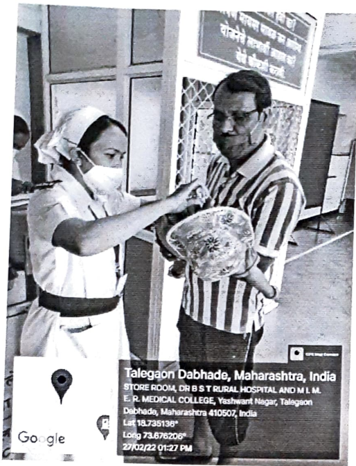
Talegaon Dabhade, Maharashtra, India STORE ROOM, DR B S T RURAL HOSPITAL AND M I M. E. R. MEDICAL COLLEGE, Yashwant Nagar, Talegaon Dabhade, Maharashtra 410507, India Lat 18.735138° Long 73.676206° 27/02/22 01:27 PM