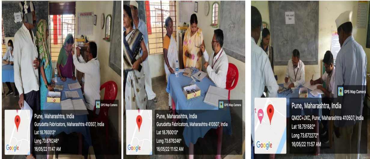
Patient checking at Ambi on 16.05.2022