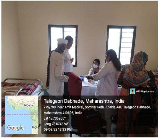
Patient Check done at KUDE Khed Taluka