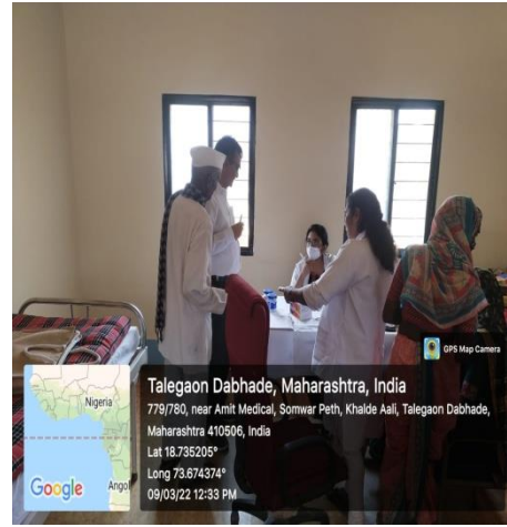
Patient Check done at KUDE Khed Taluka