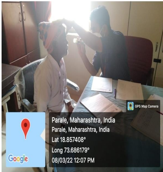
Patient Check done at Amboli Khed Taluka