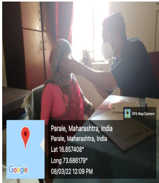
Patient Check done at Amboli Khed Taluka