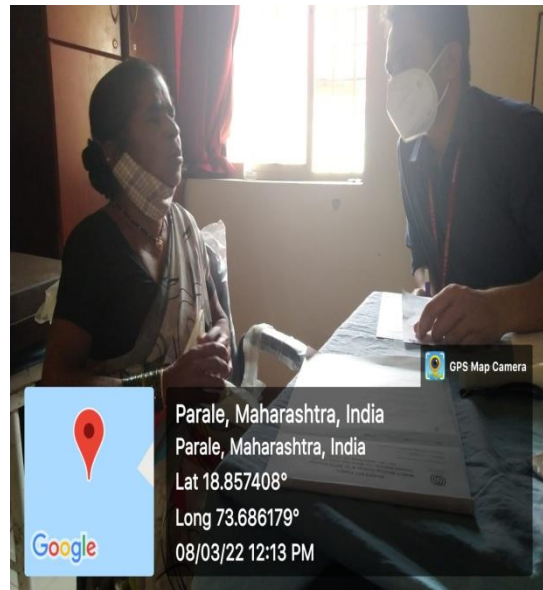
Patient Check done at Amboli Khed Taluka