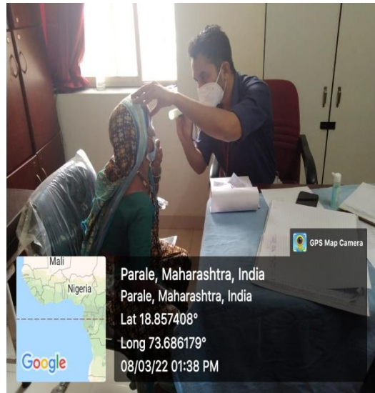
Patient Check done at Amboli Khed Taluka