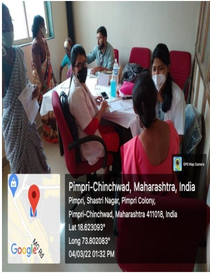
Patient check done at Dehane Khed Taluka