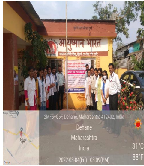
Medical Team at Dehane Khed Taluka