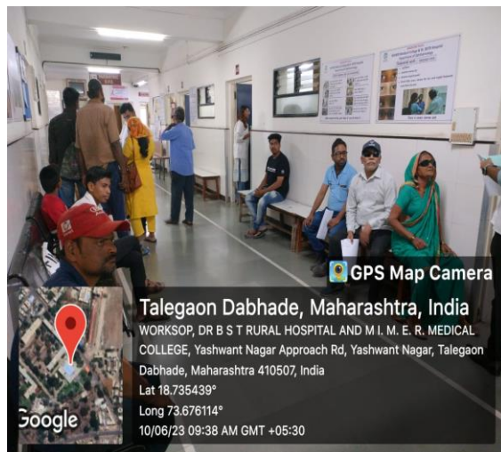
Audio Visual for patient information and registration on 10.06.2023