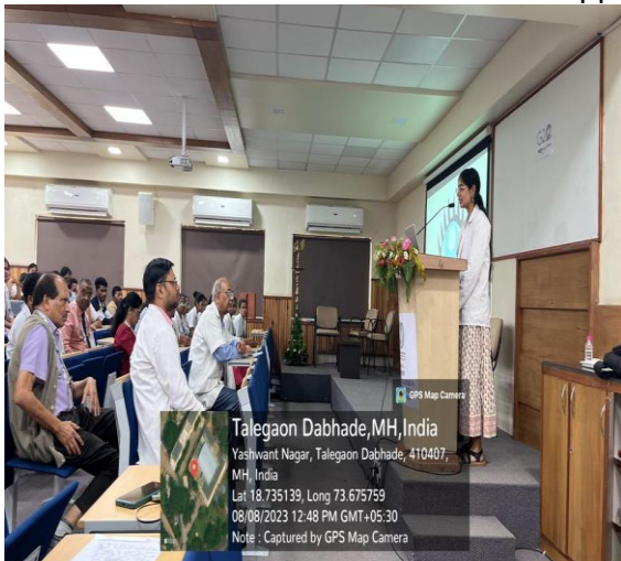
Certificate of Appreciation to the speakers

Talegaon Dabhade, MH, India Yashwant Nagar, Talegaon Dabhade, 410407, MH, India Lat 18.735139, Long 73.675759 08/08/2023 12:48 PM GMT+05:30 Note : Captured by GPS Map Camera