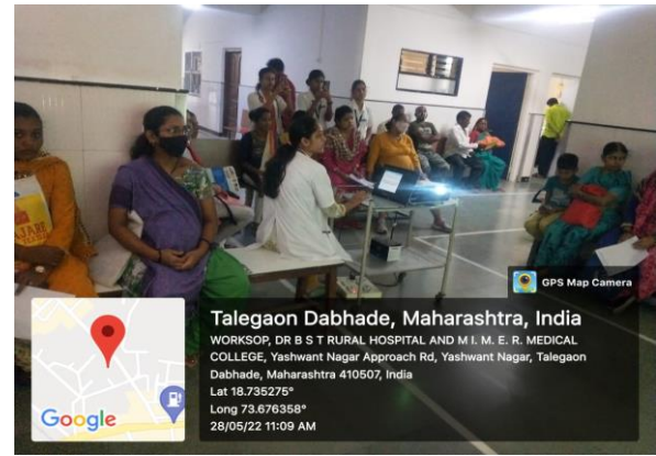
Short Film on “Violence against Women and Laws” Audience understanding Laws for Violence against Women