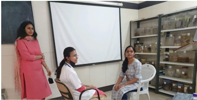
8, Yashwant Nagar Approach Rd, Yashwant Nagar, Talegaon Dabhade, Maharashtra 410507, India Talegaon Dabhade Maharashtra India 37°C 99°F 2022-03-24(Thu) 02:07(pm)