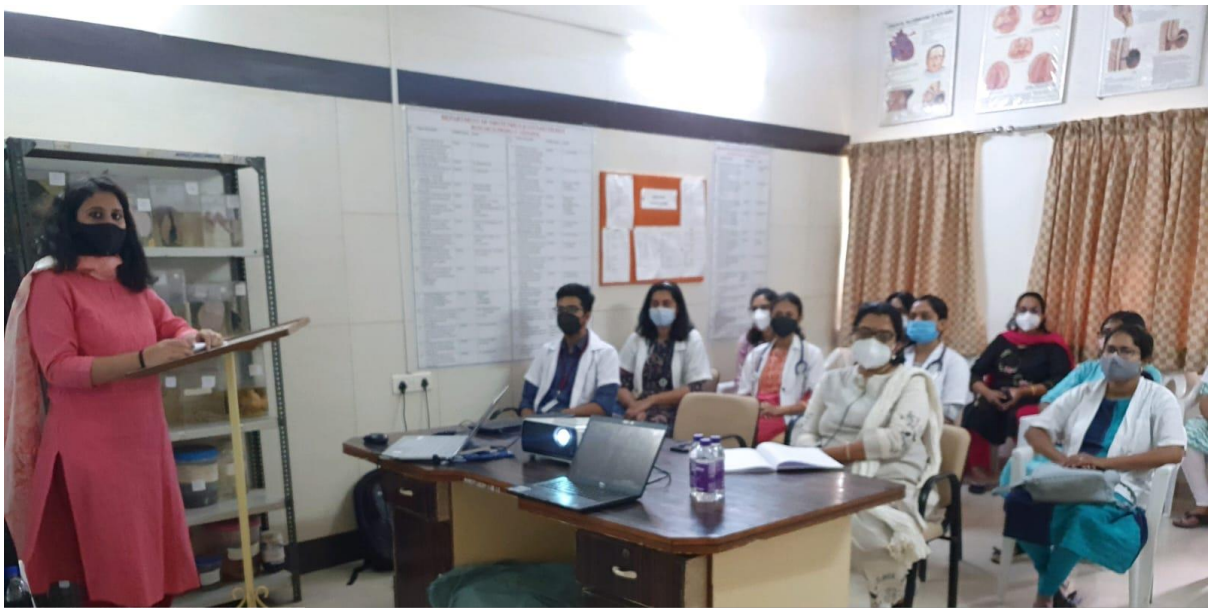
8, Yashwant Nagar Approach Rd, Yashwant Nagar, Talegaon Dabhade, Maharashtra 410507, India Talegaon Dabhade Maharashtra India 37°C 99°F 2022-03-24(Thu) 02:18(pm)