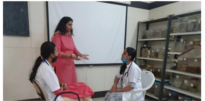
8, Yashwant Nagar Approach Rd, Yashwant Nagar, Talegaon Dabhade, Maharashtra 410507, India Talegaon Dabhade Maharashtra India 37°C 99°F 2022-03-24(Thu) 02:07(pm)