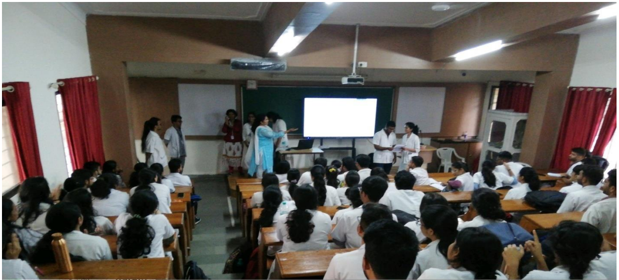
Prize distribution for wining Team