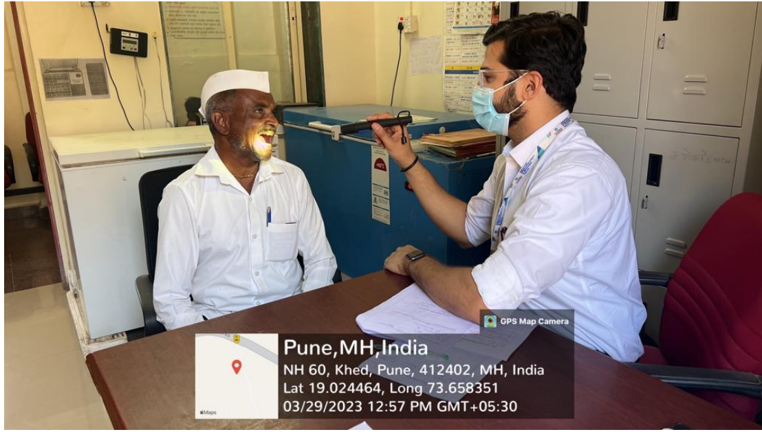
Oral Screening done by our staff