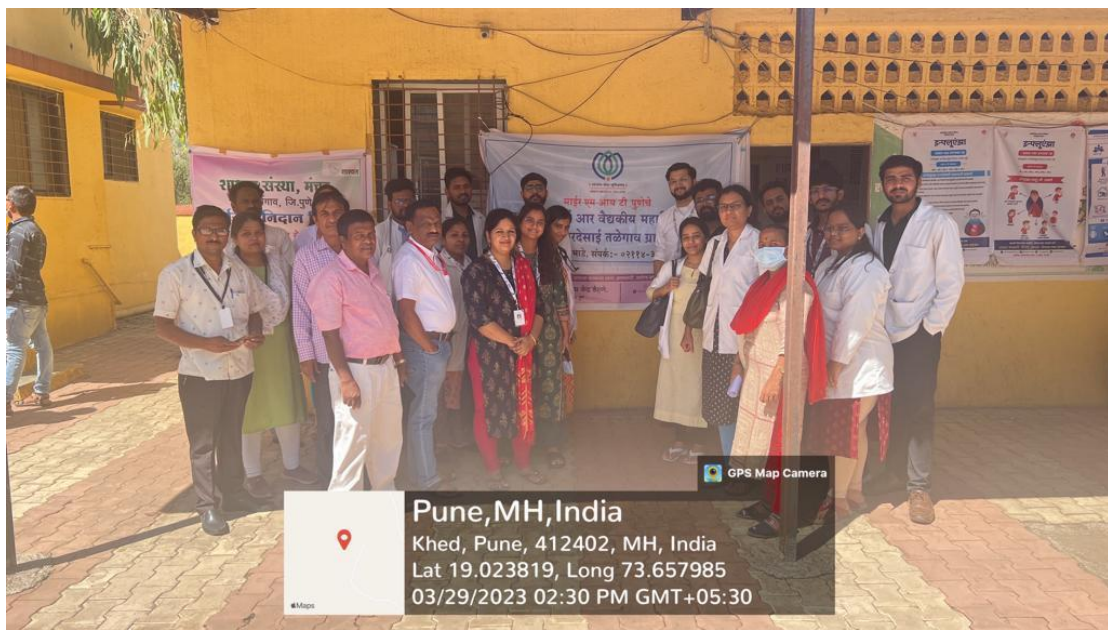
MIMER Medical College Team