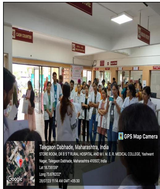
Street play at the reception area of OPD complex