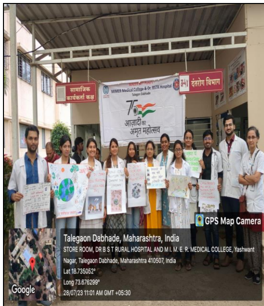
Group photo with all the participants OPD complex of Dentistry Department