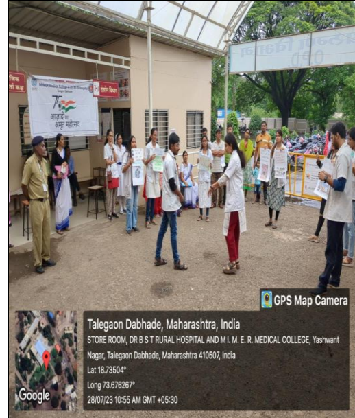
Street Play by the Interns for creating awareness regarding Air & water pollution in the OPD complex