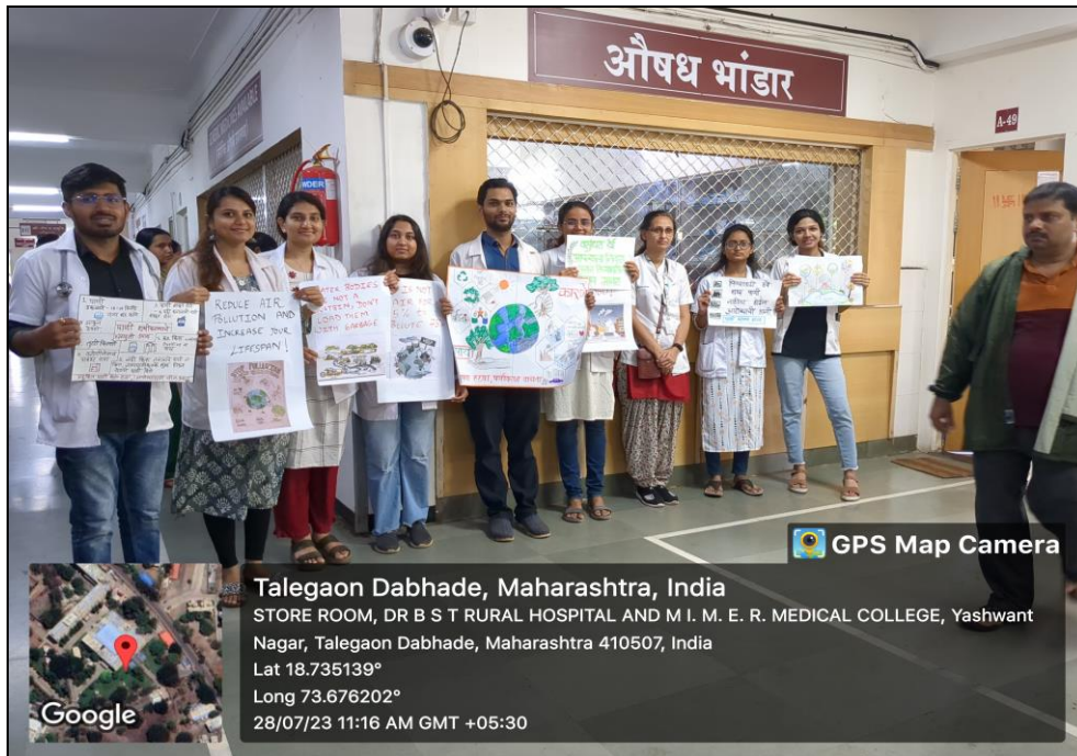
Group photo of all the performing students.